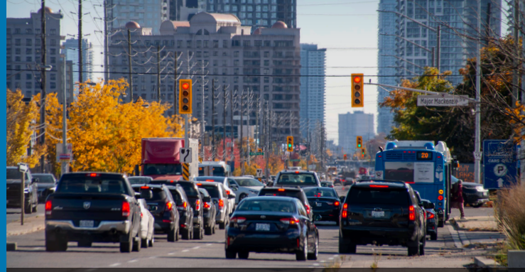
A bus in heavy traffic on Jane Street at Major Mackenzie Drive.

The York Region 2022 Transportation Master Plan identified the need for rapid transit infrastructure along the Jane Street corridor to support planned housing and job growth. This project will provide faster connections to major destinations and existing rapid transit, reduce traffic congestion and support more jobs and increased housing supply.